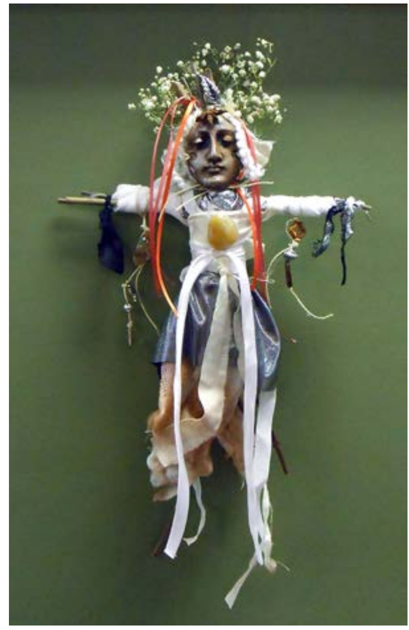
Here is my finished Spirit Doll, hanging on the wall as a blessing and as a happy creation. I named her Artemesia after one of my favorite herbs.

This is a close-up of the face. You can see the silver fabric (I cut a neck hole in a rectangle) and you can see the charms on the arms and a stone that has been hot glued to the front wrapping. The baby's breath makes a nice headdress, and the ribbons add a bit of color.