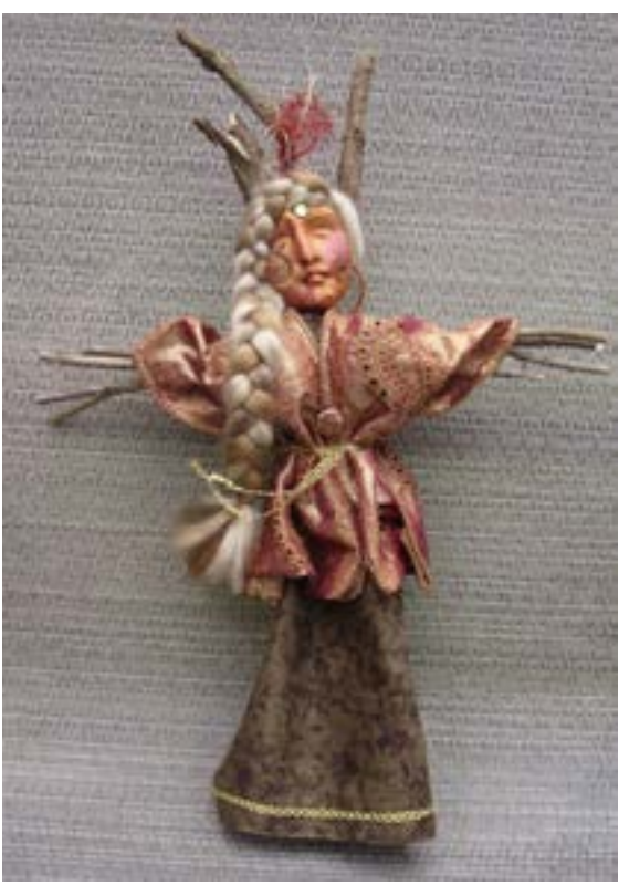
Spirit Doll by Otter