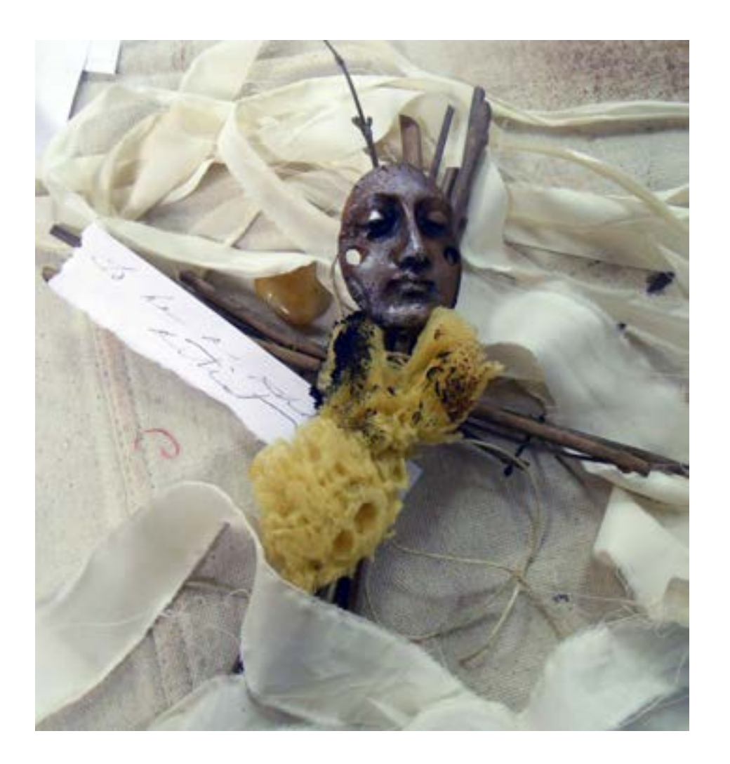
Before I began wrapping the strips, I wrote a wish on a small strip of paper and wrapped it around the sponge body. This is an important part of the process. Otherwise, your spirit doll is just a soft sculpture without Intent. You can also include small stones or charms as you wrap.